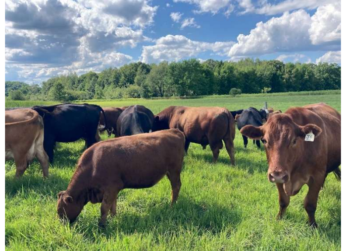
Figure 1. Calculating carrying capacity is a critical step to successful grazing.

Farms that fail to determine carrying capacity correctly can be overstocked and run out of pasture before the end of the growing season or be