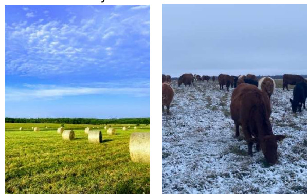
Figure 3. The process of calculating each component of carrying capacity is an opportunity for farmers to consider options such as making hay or stockpile grazing.

For more information on how to implement stockpile grazing and bale grazing, refer to Bale Grazing: A Winter Feeding Strategy and Stockpile Grazing: A Strategy for Extending the Grazing Season , available on Wisconsin's Grazing Roots resource library.