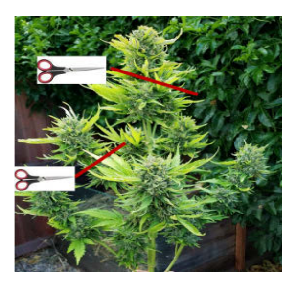
Figure 1. A plant which has reached terminal flowering, extruding stigma at the top inflorescence (Left). This figure illustrates proper sampling locations taken from hemp inflorescence located on the top 1/3 of the plant (Right).