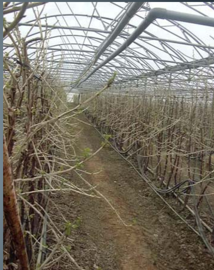
Mature cordon-trained red currants in Dutch greenhouse