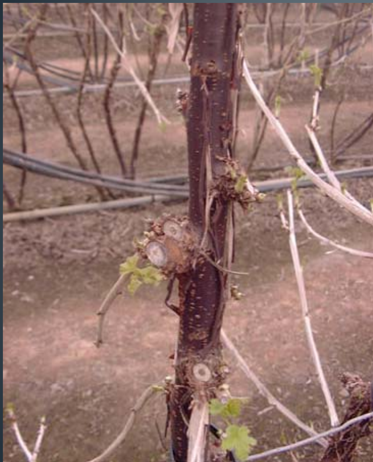
1 –yr branches spaced around cordon