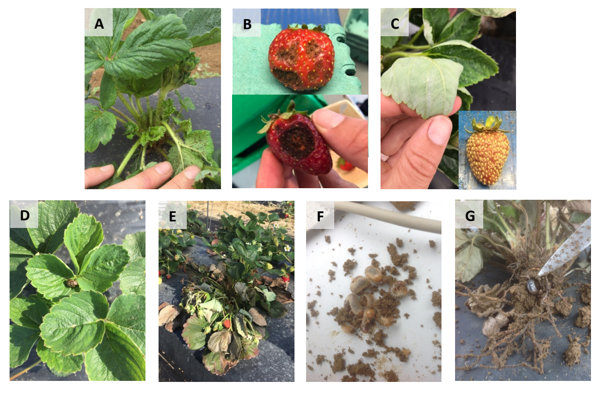
Figure 5. (A) Aphids on young strawberry plant; (B) fruit anthracnose; (C) powdery mildew on the underside of leaves and fruit; (D) an Oriental Beetle on a leaf; (E) wilting associated with Oriental Beetle feeding; (F–G) Oriental Beetle grubs found in the soil around roots.