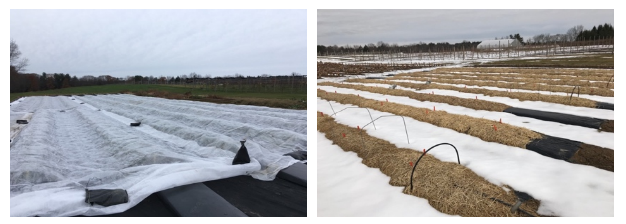
Figure 6. Left: 1.25 oz/yd<sup>2</sup> row cover. Sand bags are used to keep row cover down. Right: straw applied over plastic mulch. Low tunnel hoops are also visible, which were left in the field for the winter.

We have used both straw mulch and a single layer of 1.25 oz/yd<sup>2</sup> row cover (separately, not at once) to overwinter day-neutral plants successfully in Durham NH (Figure 6). Recommendations for row cover thickness vary substantially depending on location and who you ask. Some suppliers will recommend a single layer of 0.9 oz/yd<sup>2</sup>, while others will strongly suggest a double layer of 1.0–1.25 oz/yd<sup>2</sup>, with one layer removed in the early-spring. We do not have good research-based information upon which to inform recommendations at this time.